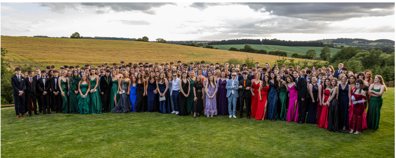
Class of 2024